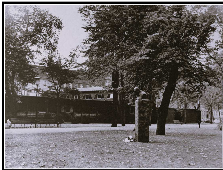
Archive photo bust of Churchill 1961

At that particular moment in time in 2003 there was no footpath in Churchill Park leading up to the bust. The original landscaping of Churchill Park in the early 1960's did have an asphalt footpath nearby close to the Museum of Danish Resistance during the Second World War with seating for members of the public to sit and reflect about the war, freedom and the leadership of Churchill. However, the footpath was removed and people lacked access in 2003. This was communicated by veterans who desired access nearer the time of his birthday in late November and when the ground was wet.