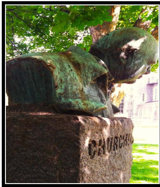
Bust of Churchill 2023

The Friends of Churchill Park would like to renovate and clean the bronze bust in its current location. There has been a debate on whether the bust should be relocated to a better location however practicalities and regulations have made the exercise unviable. It should be noted the foundation of the bust is thought to be nearly 1 meter deep and so any cleaning and renovation will need to take place on site. It is hoped that any work carried out will safeguard the bronze artwork and also preserve the granite plinth for many decades. It is also proposed the granite plinth be treated with anti graffiti spray used on historical stonework. The same anti graffiti will be used on the path stones. The shipping magnate Maersk McKinney Møller did suggest cleaning of the bust would take place in 2003 but this never occurred leading to the rather poor state today.