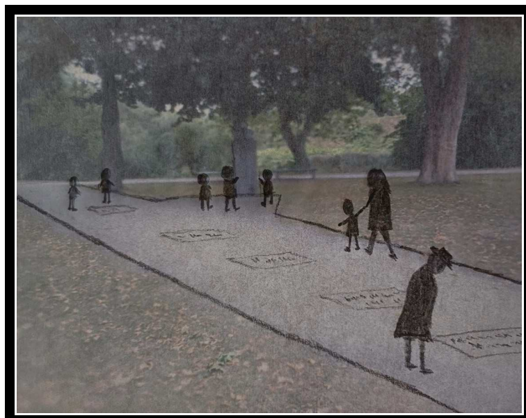
Visualisation of completed path 2025