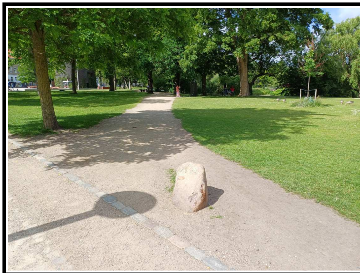
Photo of current footpath

The landscaping contractor will be required to ensure the site is safe and poses no risk to the public during building work as set out under normal regulations in public places.