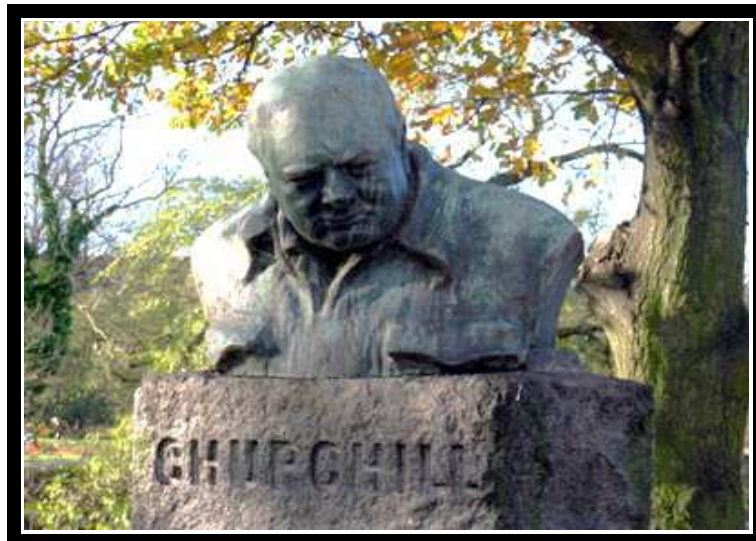
Bust of Churchill 2005

A new Copenhagen landmark to celebrate 80 years since the ending of the Second World War