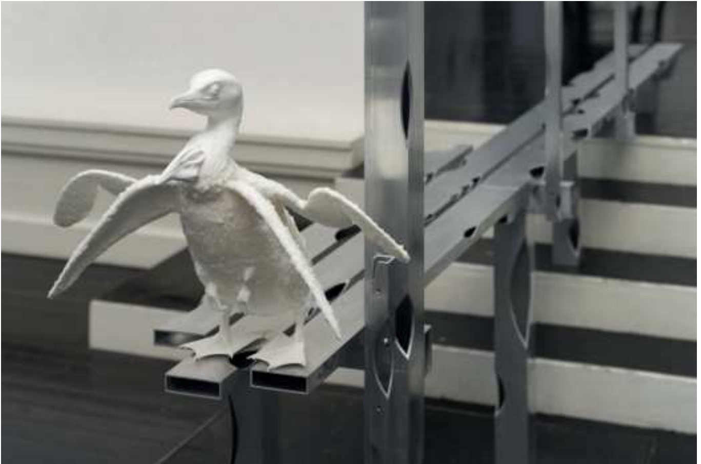
Ufe Isolotto with Soft Baroqu, "Sekaleht: A Small Bridge with Two Ways", 2021, aluminium, paint, polystyrene, wax, epoxy, photo credit: David Stjernholm, courtesy the artist