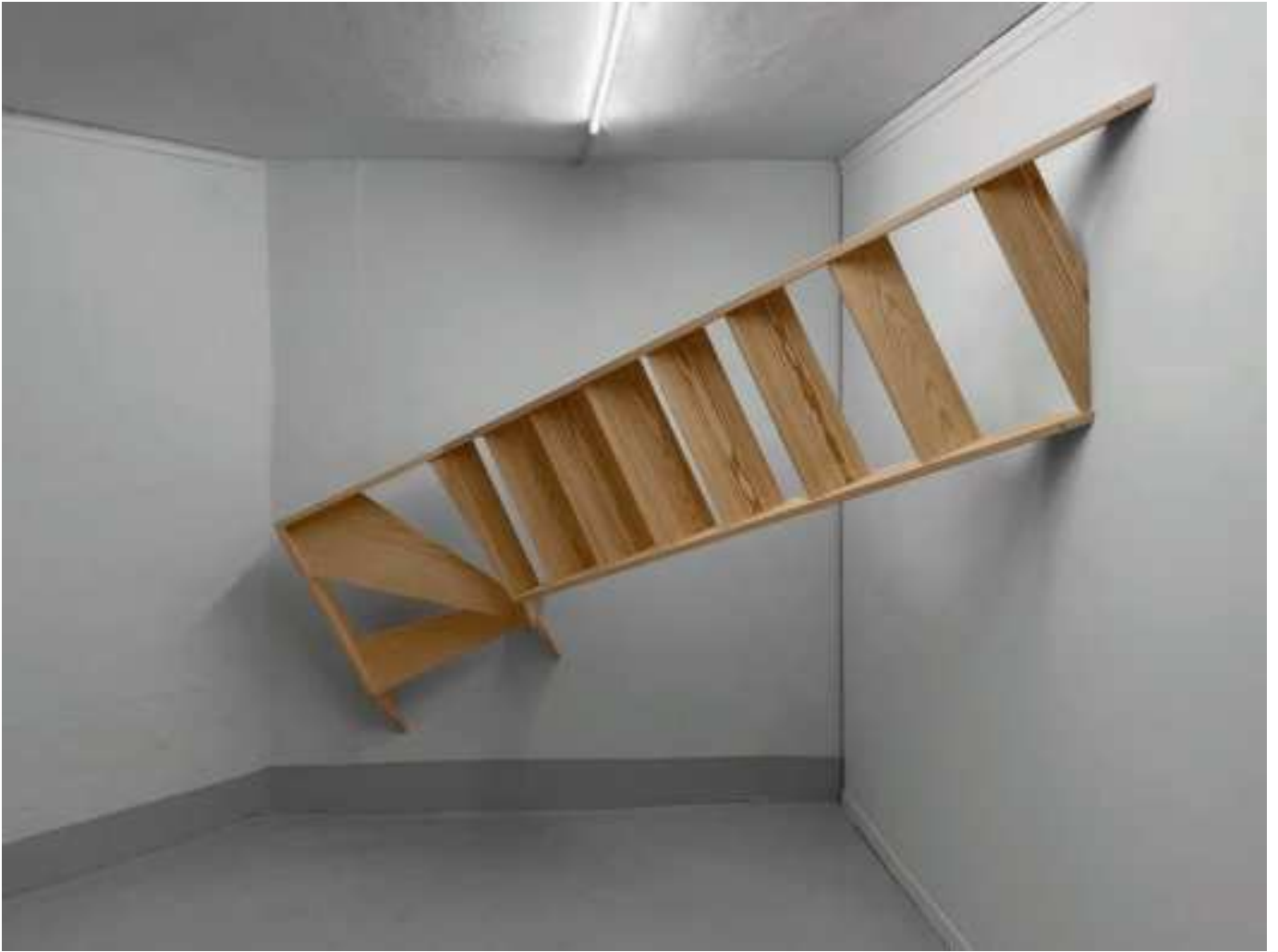
Rebecca Krasnik, Sometimes , 2021. An installation where a bodily experience of time is juxtaposed with an experience of time that is more fluid and accelerates into the indefinite.