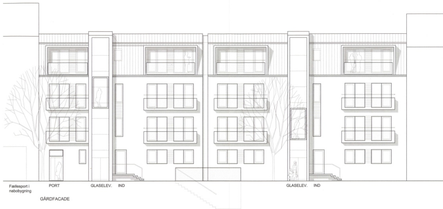
Sverrigsgade - Nordfacade mod gård 1:200