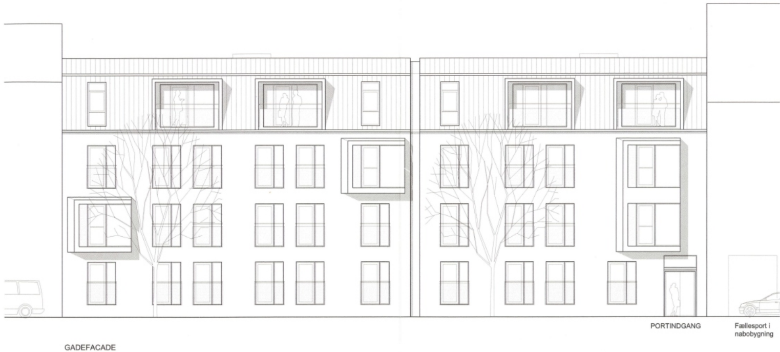
Sverrigsgade - Sydfacade mod gade 1:200