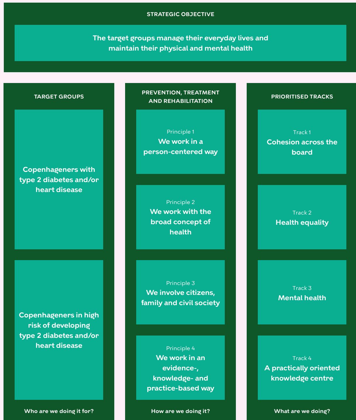
Figure 2. The content of the action plan